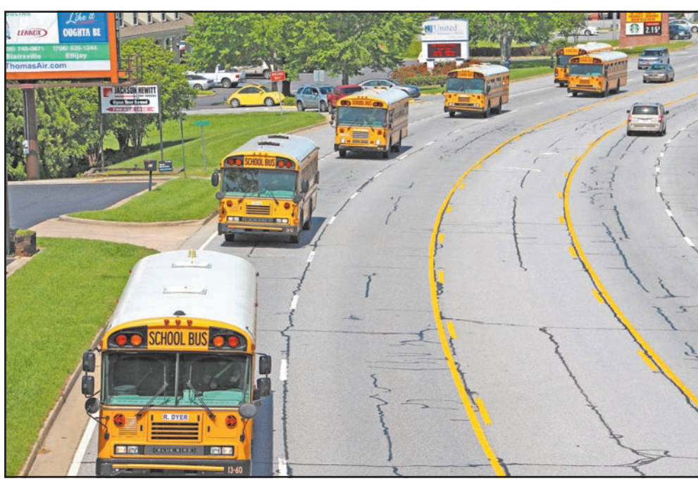
Buses letting out onto Georgia 515 in May – will return Friday, Aug. 4.