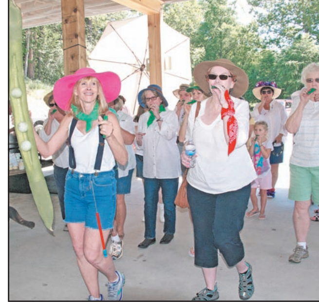
The Washboard Band performing in the Kazoo Parade during the Green Bean Festival.

By Lily Avery North Georgia News Staff Writer Green beans were the talk of the town at the Union County Farmers Market last weekend as the Market celebrated its 8th Annual Green Bean Festival on Saturday, July 29. Canned green beans, fresh green beans, green bean apparel, even green bean pizza – anything and everything green bean related could be found at the market on Saturday as hundreds of patrons piled in to the Market for the yearly festivities. To spotlight the locally popular vegetable, the Market hosts a slew of events, contests and door prizes throughout the day of the festival, beginning with the green bean canning