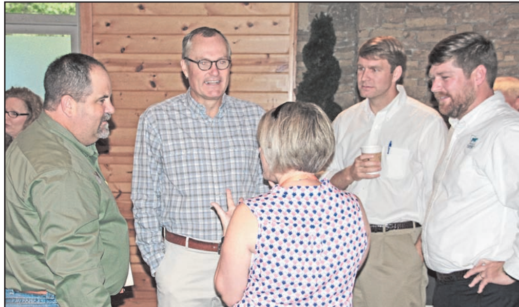
Cagle speaking with members of the Georgia Cattlemen's Association at The Ridges in Young Harris.